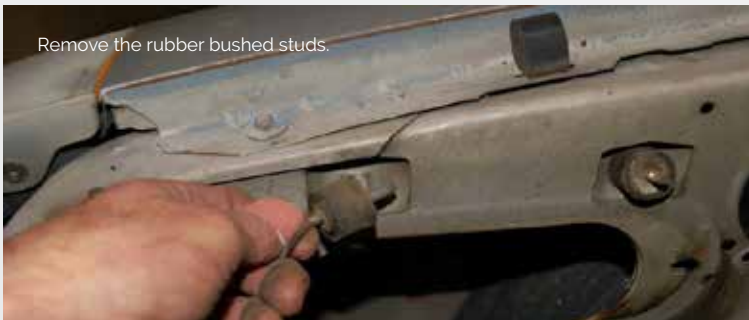
Remove the rubber bushed studs.

Loosen clamp on inlet tube at throttle body, unbolt Mass Air Meter bracket, remove the two nuts that secure the air box, remove entire stock air intake.