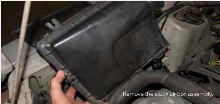
Remove the stock air box assembly.

Loosen clamp on inlet tube at throttle body, unbolt Mass Air Meter bracket, remove the two nuts that secure the air box, remove entire stock air intake.