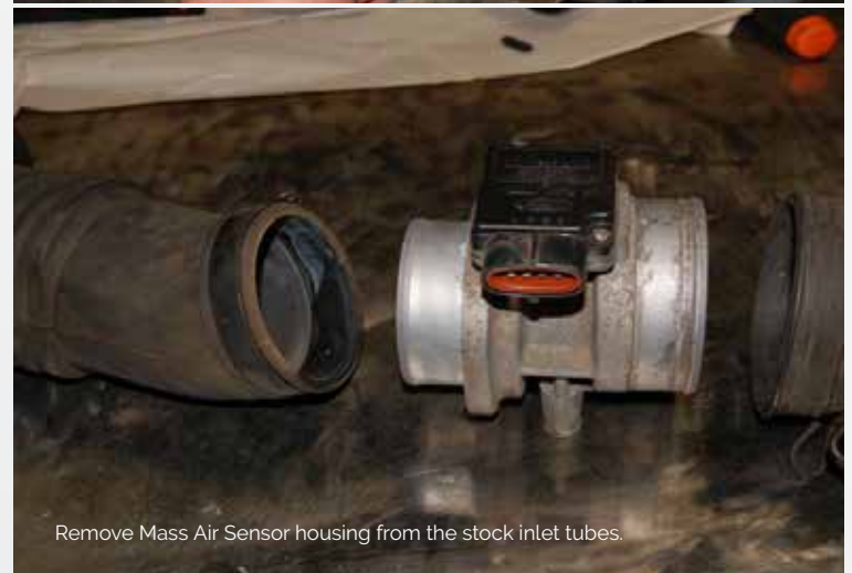
Remove Mass Air Sensor housing from the stock inlet tubes.