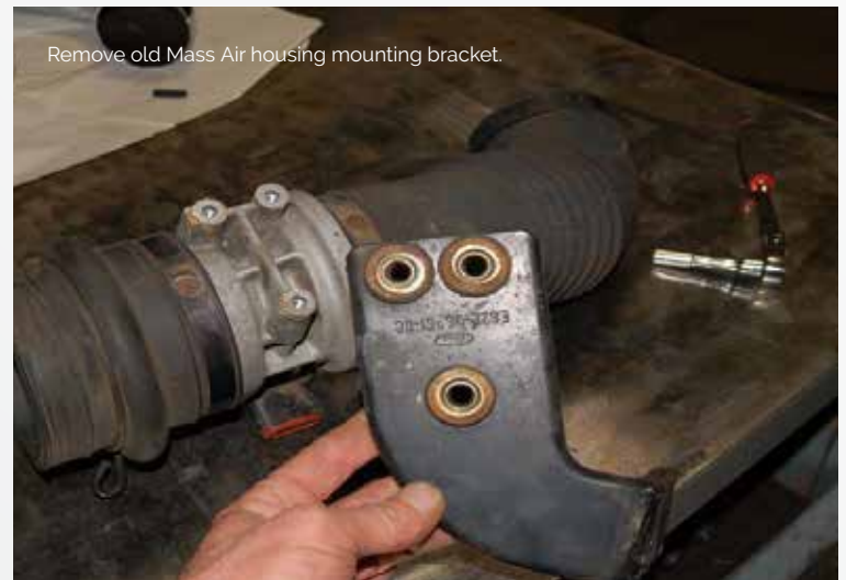
Remove old Mass Air housing mounting bracket.

Remove the stock inlet hoses from the Mass Air Sensor housing. Remove the stock bracket from the Mass Air Meter housing. This bracket will not be reused.