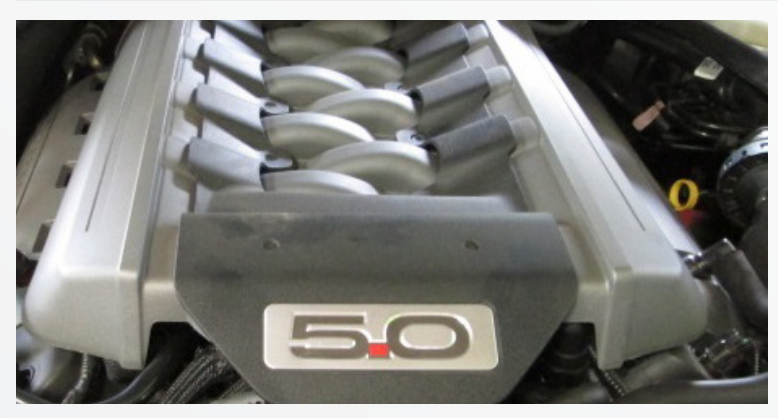
Re-install the engine cover.