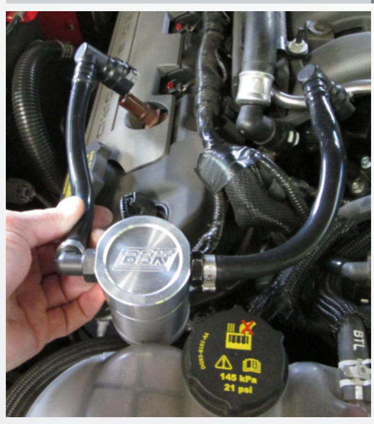
Install the (2) vacuum hoses supplied in the kit onto the BBK oil separator canister.

NOTE: When installing the hoses be sure that the BBK logo on the oil separator is facing towards you and install the big curved hose on the right side and the straight bent hose on the left side.