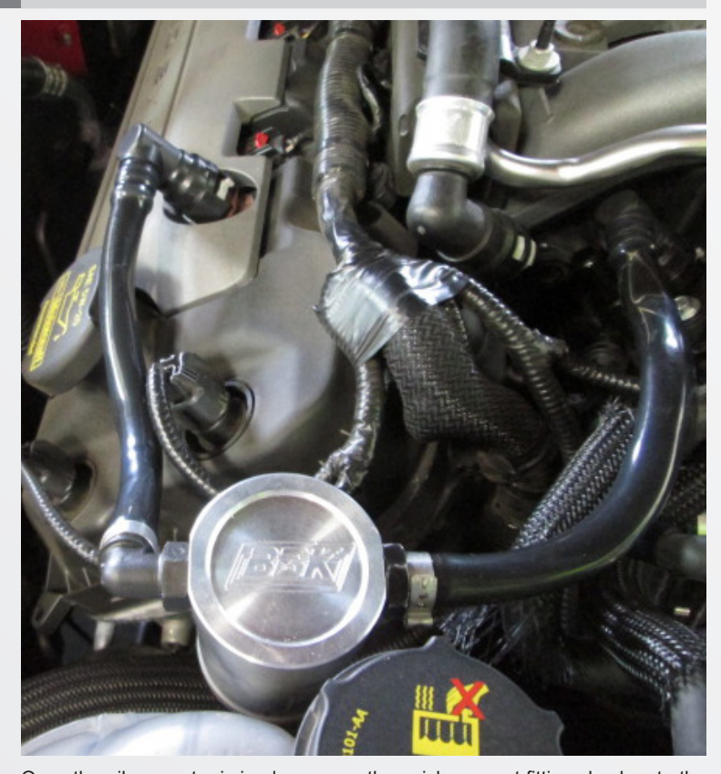
Once the oil separator is in place press the quick connect fittings back onto the barb fitting on the intake and valve cover.