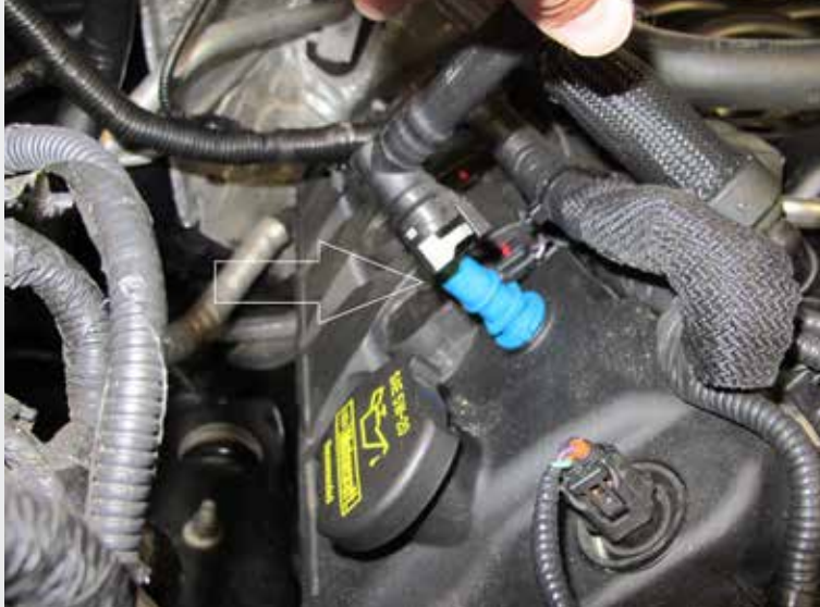
Disconnect the vacuum hose that connects from the passenger side valve cover to the intake manifold next to the throttle body.