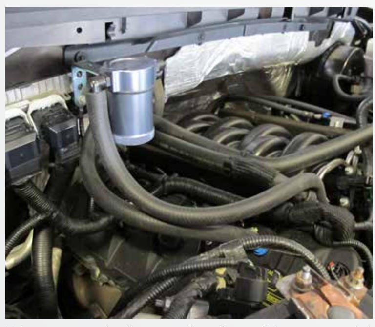
Maintenance empty the oil separator of any oil every oil change or as needed.