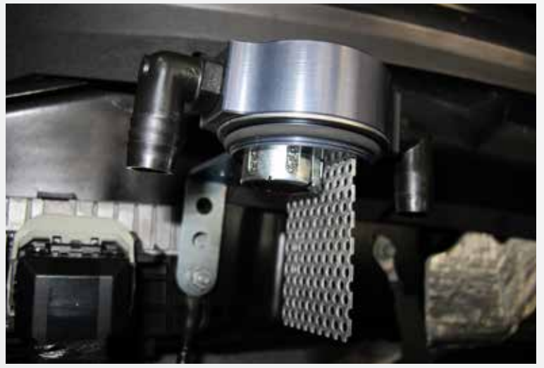
Install the BBk oil separator lid and lower catch can onto the bracket.