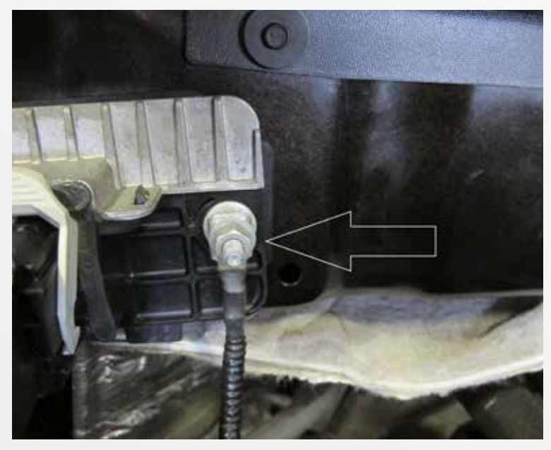
Remove the 10mm nut from the stud on the passenger side firewall, install the BBK oil separator bracket over the stud and reinstall the 10mm nut and tighten it down.