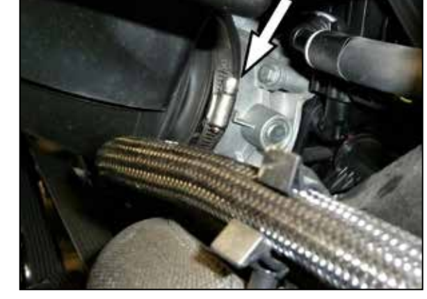
5. Loosen the hose clamp that secures the intake plenum to the throttle body. Remove the intake plenum from the vehicle.