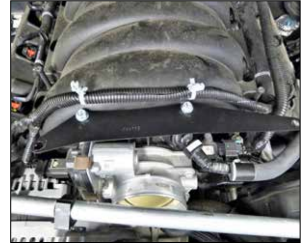
8. Install the provided mounting bracket onto the intake manifold using the provided hardware.