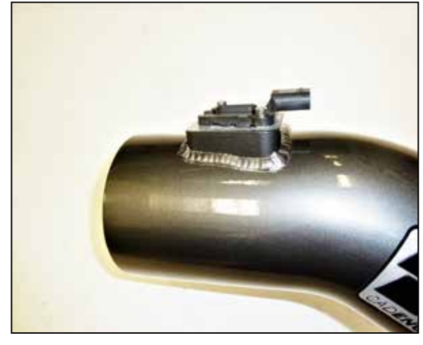
10. Remove the mass air sensor from the factory air filter housing and install it using the provided bardware