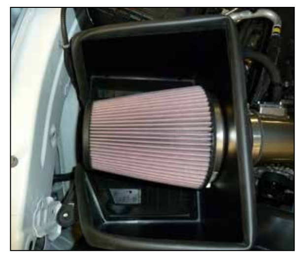
21. Install the K&N air filter onto the adapter and secure with the provided hose clamp.