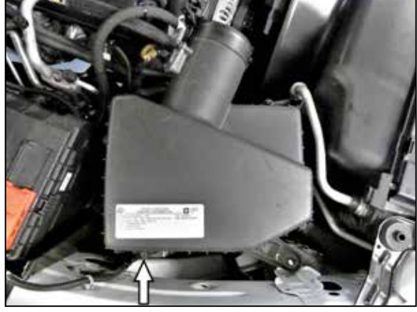
6. Loosen the seven screws that secure the upper air filter housing to the lower housing, then remove the upper housing and factory air filter.

4. Loosen the hose clamp securing the intake hose to the air filter housing. Disconnect the mass air sensor electrical connection.