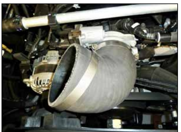
15. Install the angled coupler onto the throttle body

14. Install the heat shield assembly onto the factory lower air filter housing and secure with the seven screws provided.