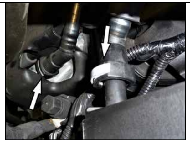
3. Push in the locking tabs on the CCV quick connect fittings and then remove the CCV hose assembly from the vehicle.