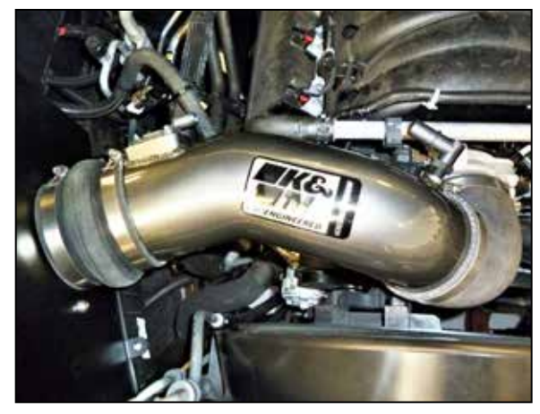
17. Install the intake tube into the couplers, adjust the coupler and tube for best fit and then secure with the provided hose clamps.