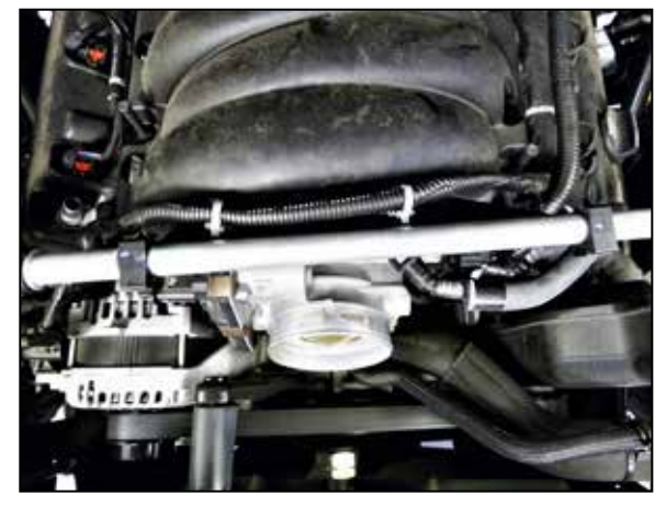
9. Secure the wiring harness and coolant pipe to the mounting bracket as shown.